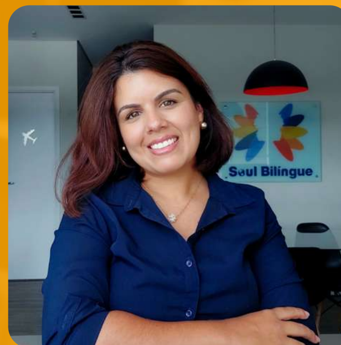
StudyTravel Star Award