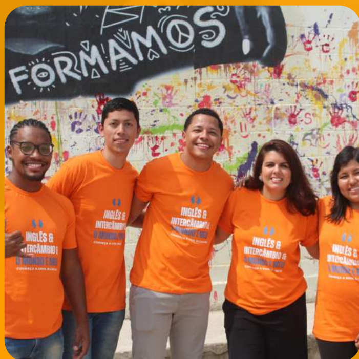
The Pie News London