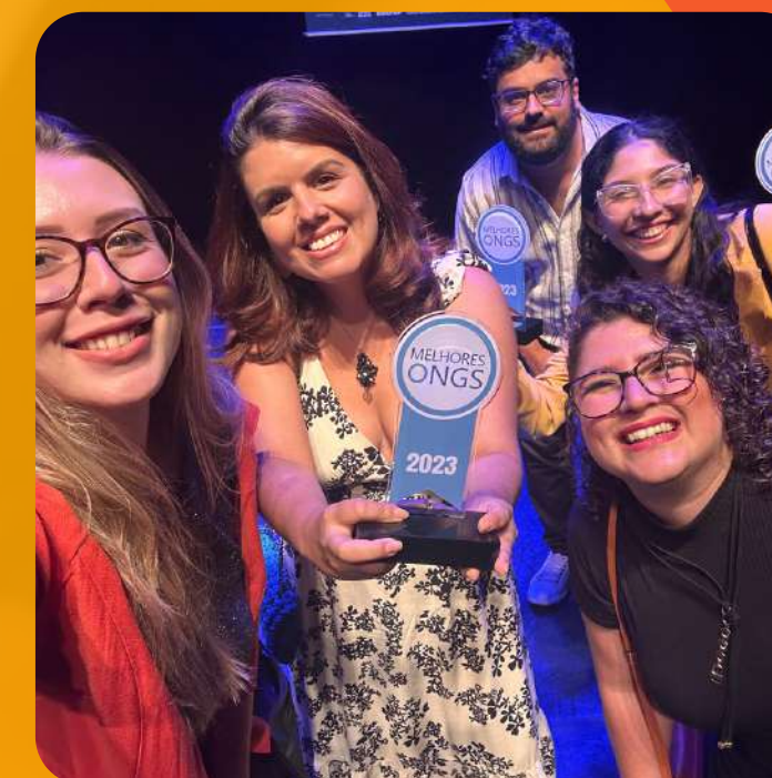
Best NGOs 2022-2023