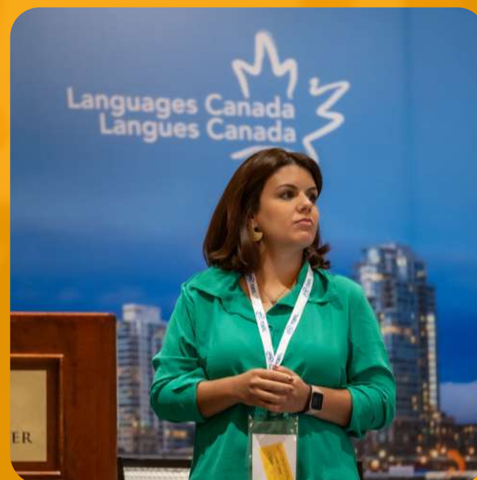
Languages Canada Vancouver